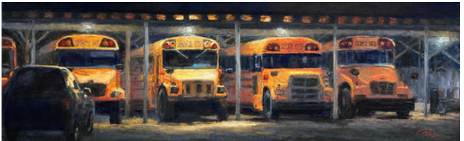
"Standing at the Ready" 10"x32"