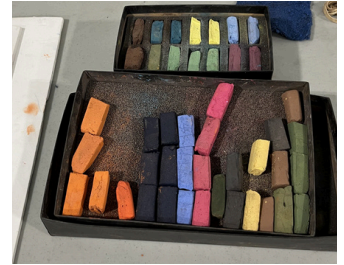
The finished pastels