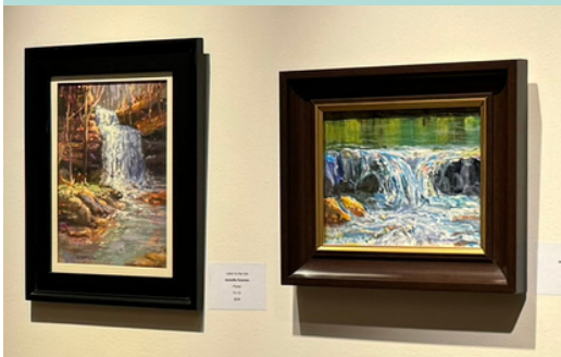
"Listen to the Fall" 12"x9"