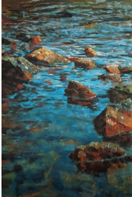
"Memory of Youth" 24"x16"

On October 11th Clint's painting "Memory of Youth" was selected for the current IAPS 2024 Juried Webshow – 45th Open Division.