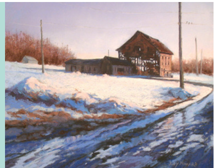
"On A February Afternoon" 8.5"x 10.5"