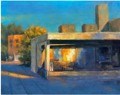
"Morning Deliveries" 11"x14"