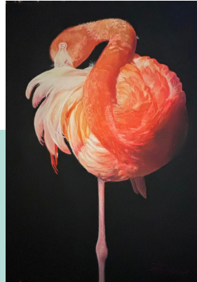
"En Pointe" 12"x9"